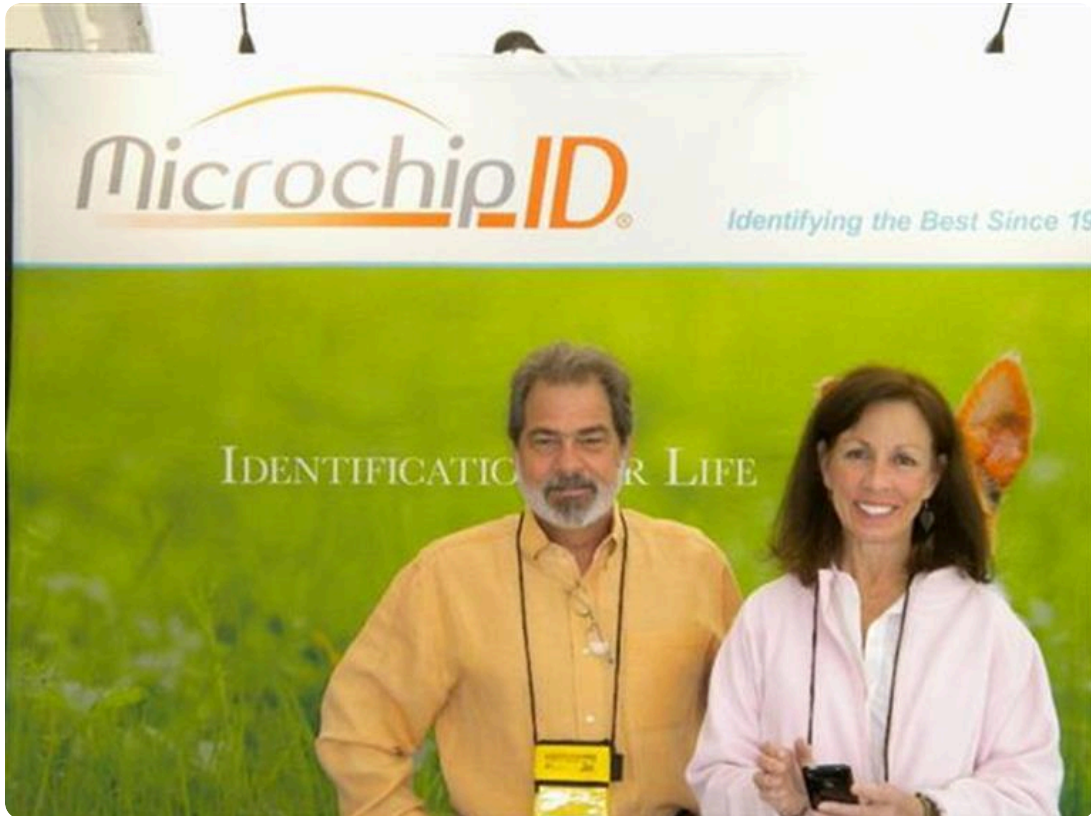
Two peas in a pod.